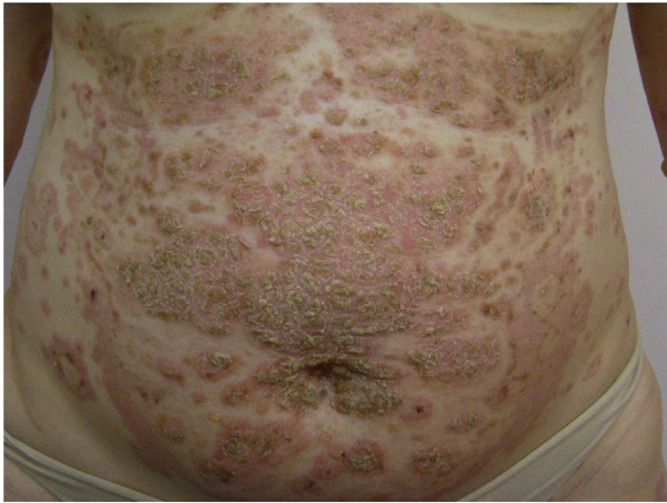
Fig. 1. Pemphigus foliaceus during pregnancy: Superficial erosions and crusts on the abdomen

“linear IgA dermatosis and pregnancy”, “dermatitis herpetiformis and pregnancy”, and “epidermolysis bullosa acquisita and pregnancy”. We extracted data that could answer the predefined questions and combined it to write this narrative review.